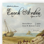
Enoch Arden J127